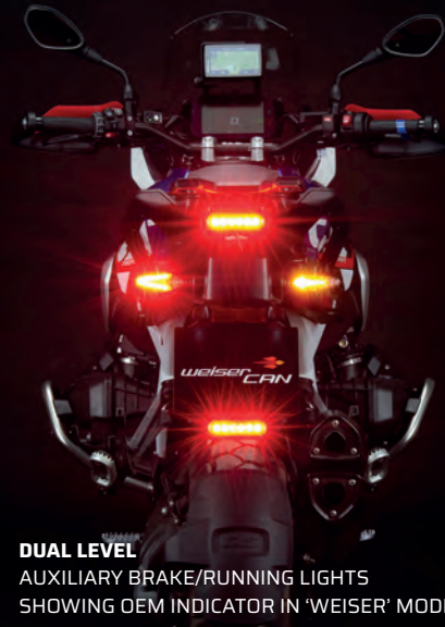
DUAL LEVEL AUXILIARY BRAKE/RUNNING LIGHTS SHOWING OEM INDICATOR IN 'WEISER' MODE