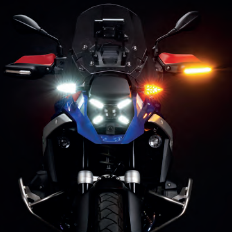
DUAL FRONT INDICATORS SHOWING WHITE DRL INDICATORS SYNCED IN 2 POSITIONS