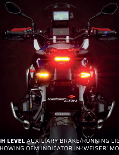
HIGH LEVEL AUXILIARY BRAKE/RUNNING LIGHTS SHOWING OEM INDICATOR IN 'WEISER' MODE