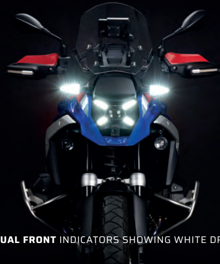
DUAL FRONT INDICATORS SHOWING WHITE DRL