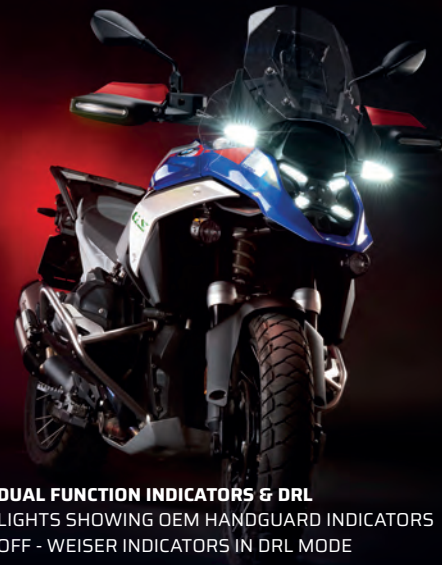
DUAL FUNCTION INDICATORS & DRL LIGHTS SHOWING OEM HANDGUARD INDICATORS OFF - WEISER INDICATORS IN DRL MODE