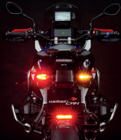
LOW LEVEL AUXILIARY BRAKE/RUNNING LIGHTS SHOWING OEM INDICATOR IN 'WEISER' MODE