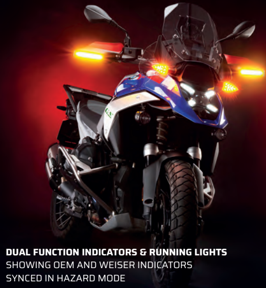
DUAL FUNCTION INDICATORS & RUNNING LIGHTS SHOWING OEM AND WEISER INDICATORS SYNCED IN HAZARD MODE